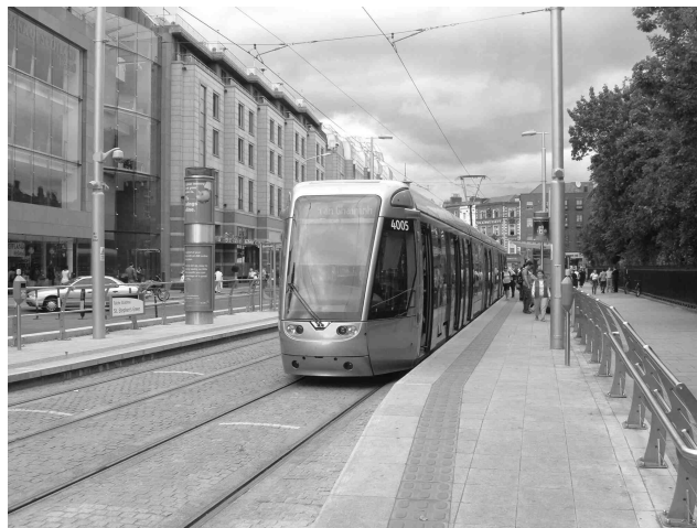
Illustration 1: Dublin

London, the largest Western European city to apply the congestion charge, is caught up in what certain politicians think is an acceptable choice, tube, bus or an entry charge. Without doubt, the tube is vital to London but, being interurban orientated to feeding passengers from distant suburbs into the CBD, it has to keep its central area underground stations to an absolute minimum.