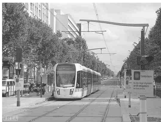
Illustration 2: Paris T3

The bus is designed more as a gap-filler between stations and as such provides a more intimate public service. A British holiday visitor using the local tram services in Europe cannot help but notice the many advantages. This especially applies to the quick understanding of the routes in a strange town. Access of the vehicles requires so little effort, something picked up and now adopted here.